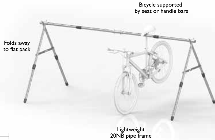
BR01C Rack End View 1263

The BR01C rack comes flat packed and folds away after use for easy storage. Cyclists will use their seat or handlebars to mount their bicycle onto the rack. Capacity is nominal as it is not governed so spacings of a bike every 300mm is possible although cramped. If planning for triathlon events then aim for 600mm spacings per bike.